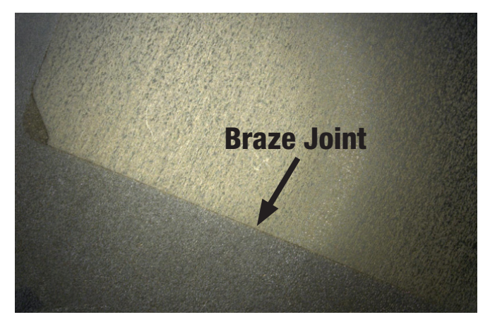
Silvacut (No Porosity)