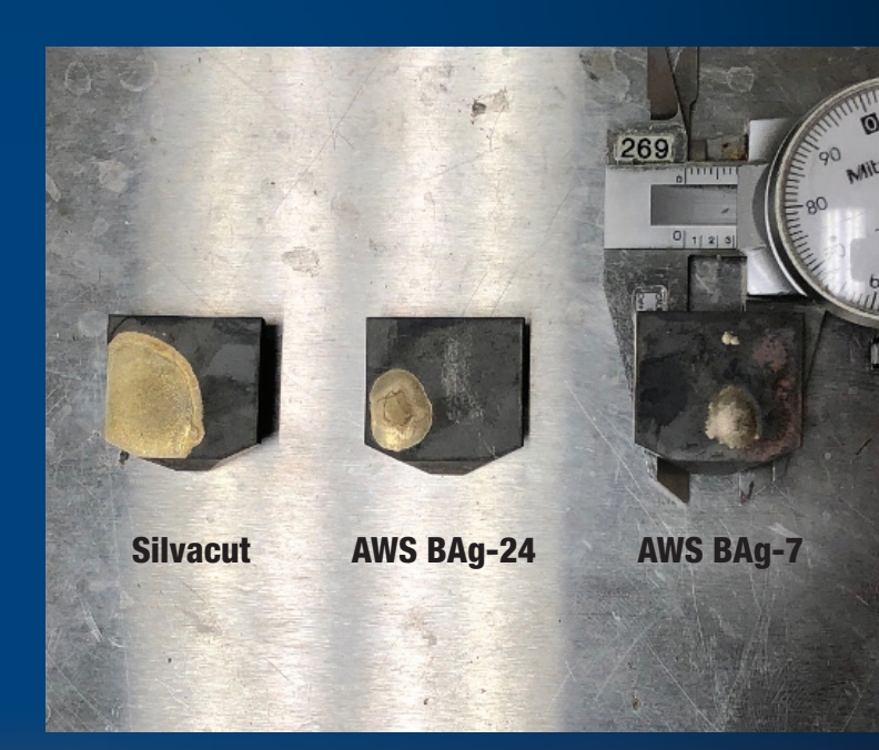
Figure 1: Wetting of C2 Carbide

Silvacut offers superb wetting on tungsten carbide, even on lower cobalt bearing grades such as C2 (6% Co). By virtue of its optimized nickel and manganese content, Silvacut flashes farther than other common carbide brazing alloys such as AWS BAg-7 (56Ag/22Cu/17Zn/5Sn) and AWS BAg-24 (50Ag/28Zn/20Cu/2Ni) as seen in Figure 1. And while other alloys such as AWS BAg-22 (49Ag/23Zn/16Cu/7.5Mn/4.5Ni) also contain manganese, the amount used often creates a slag on top of the joint that can make seeing the joint difficult during brazing operations. The higher manganese content also leads to more tenacious oxide formation which leads to an increase in flux consumption and number of overall flux inclusions within the joint. Lastly, Silvacut eliminates the need and skill required to smear molten filler metal to enhance wetting. This in turn minimizes the heat effect which is detrimental to the PCD.